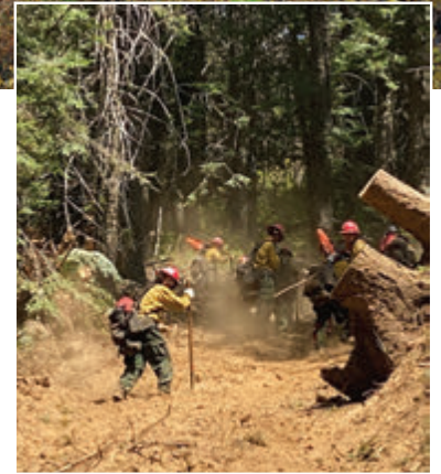
Right: Fire crews Construct a Dozer-Line Firebreak.

Want to learn more about becoming Firewise? Visit www.nfpa.org/Education-and-Research/Wildfire/Firewise-USA today.